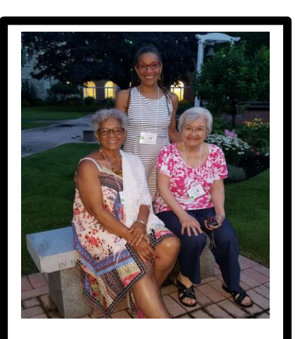
AAUW Rockland Reps at Leadership Conference in Cazenovia, NY